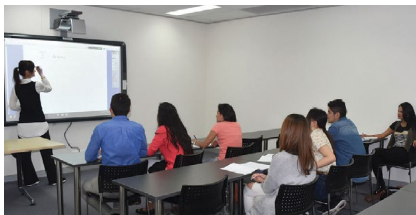
IMAGE: General English students learning in one of the classrooms at our Brisbane Campus