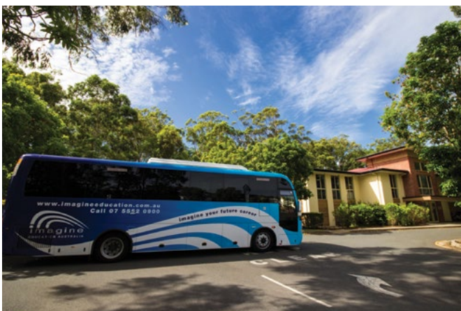
IMAGE: Students can travel for free on Imagine's bus between our Main Campus, Southport Central Campus, and Surfers Paradise