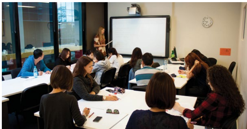
IMAGE: General English students learning in one of the classrooms at our Southport Central Campus