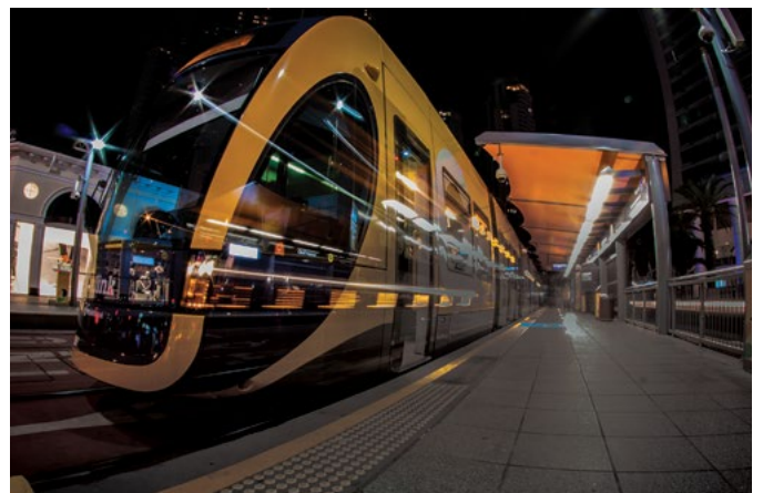
IMAGE: G Link trams run from Southport to Broadbeach and are an easy and affordable transportation method