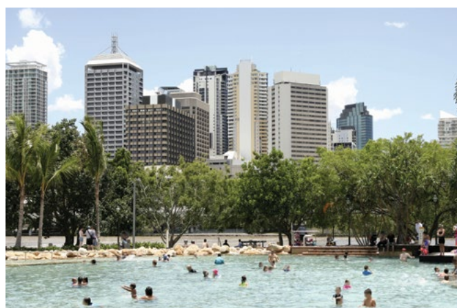
IMAGE: Take a dip in the man-made ocean at South Bank Parklands, across the river from Brisbane City